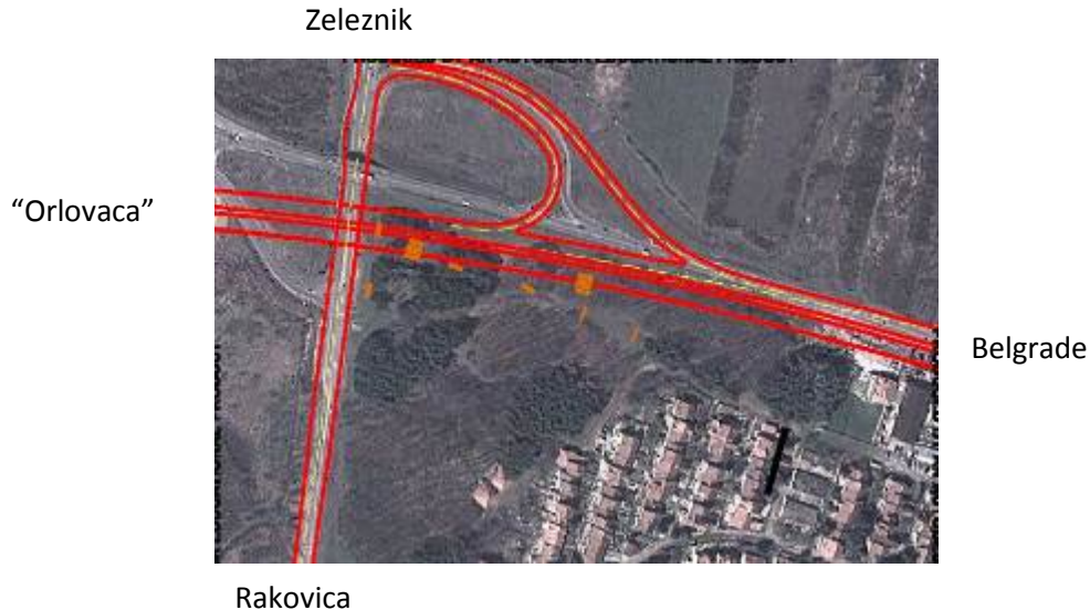
Figure 03: Improved Detailed design of new “Petlovo Brdo” Interchange

The alternative Project solution comprises a reduced number of direct and indirect ramps, which indeed spares a significant part of Park-Forest “Borici”, improved and safer accesses for the side streets into Ibarska road and enhanced environmental mitigation and compensation measures. The outline of the revised project is shown in Figure 03 and the main characteristics described below.