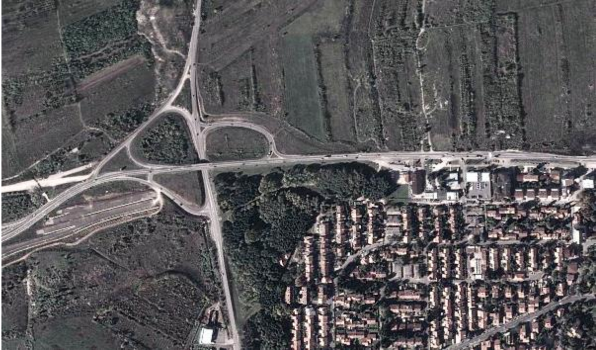
Figure01: The existing – already constructed “Petlovo Brdo” Interchange

The existing – already constructed “Petlovo Brdo” Interchange ( Figure 01) is been used for traffic for years now and it is located within the zone of settlement “Petlovo Brdo”, on the crossing of the existing Ibarska road and the regional road which is connecting Zeleznik and Rakovica settlements. This interchange is only temporary solution until new “Petlovo Brdo” Interchange will be constructed. The existing “Petlovo Brdo” Interchange with the belonging part of the Ibarska road is defined as “black spot” on the traffic network in the Republic of Serbia with permanent traffic accidents with fatalities that often occur.