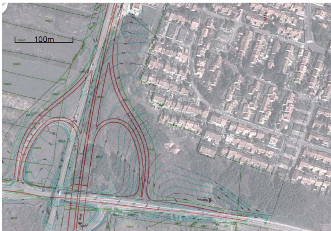
Figure 02: Original Detailed design of new “Petlovo Brdo” Interchange