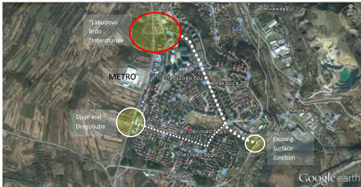
Figure 04: location of interchange “Labudovo Brdo” and connections with a Ring Road

A safe surface junction in zone of Djuje & Dragoljuba Street is integral part of this proposal now. Preparation of Project changes and improvement commenced during July 2015, after a several rounds of meetings with relevant Belgrade City authorities. Direct contact with City of Belgrade authorities is established and on May 21, 2015, a meeting with City of Belgrade Traffic Directorate representatives is held. It was concluded that proposed project changes should be developed into a proper Detailed design.