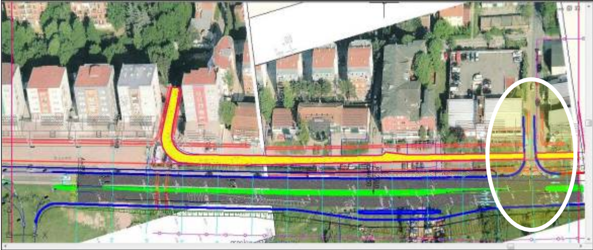
Figure 05: Extract from Conceptual design 2015 – Safe junction and service roads

equipment of surface junction were considered by City authorities and other experts during junction design phase.